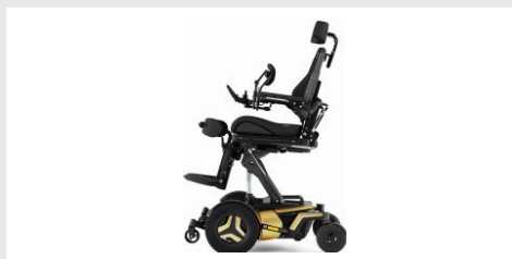
Seat Elevator Active Height 0-350 mm