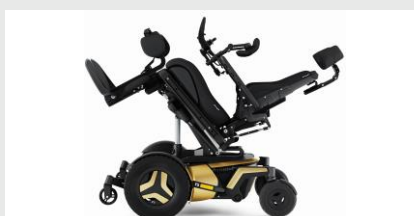
Posterior Tilt 0-50°