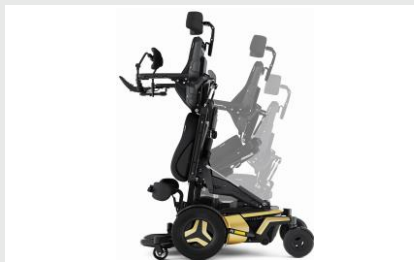
Sit to Stand Seat Function

Measurements are approximating and subject to change without notice