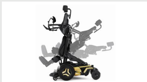
Lying Position to stand seat Function