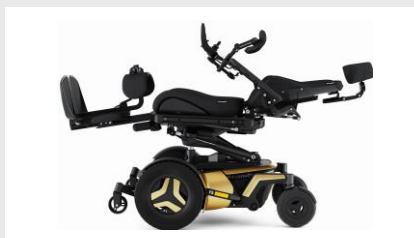
Power Recline of 85-180°